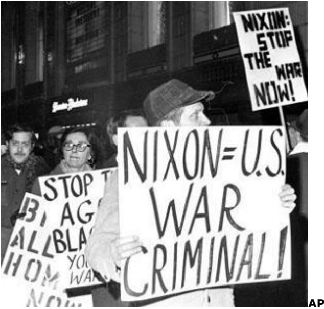
Demonstrators outside Chicago's Blackstone Hotel on February 5, 1970, to protest the visit of President Richard Nixon

ANTI-WAR PROTESTERS: "Hell no, we won't go!"